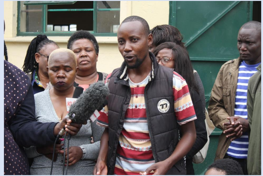
Press and Media Briefing