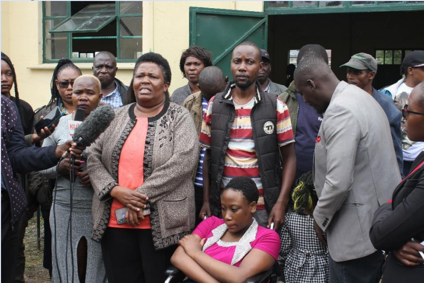
Area Chief inaugurating the occasion