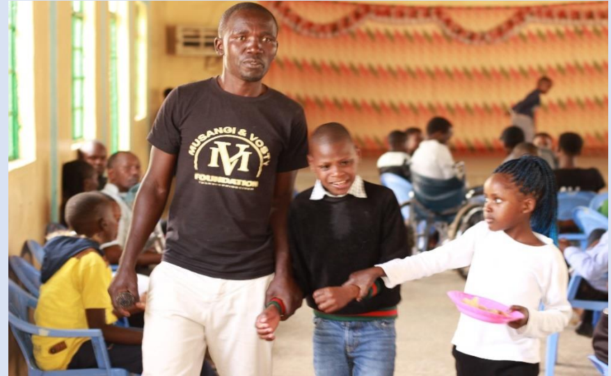
Sharing good time with the kids and caregivers