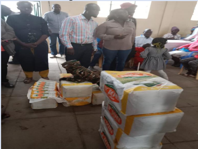
Team serving meal