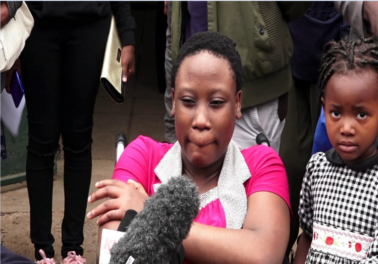
VENUE SOWETO SOCIAL HALL