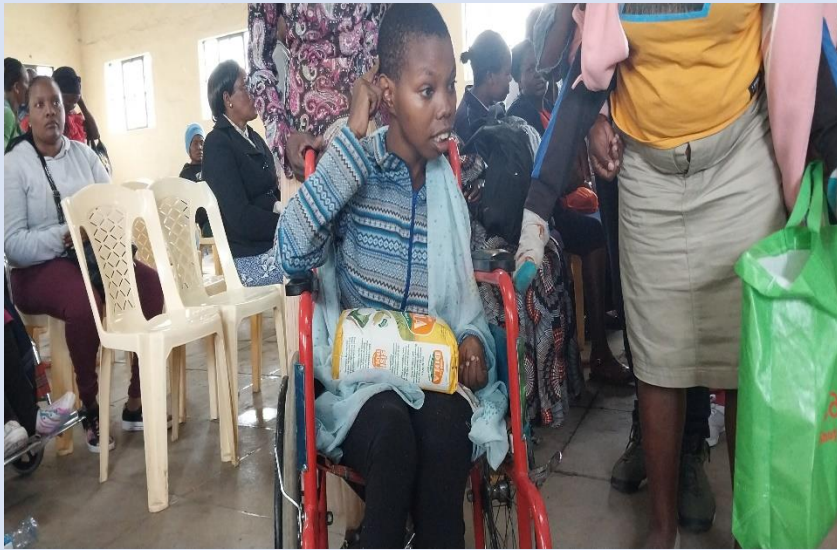
Team distributing food